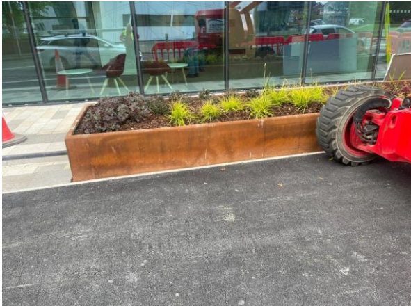
BROMOCO CT7571W will protect against all these elements and should be applied as soon as the installation is complete.

Repairing this is complex and time consuming, however BROMOCO Network applicators are skilled at repairing and restoring and sealing patina that is damaged in this way.